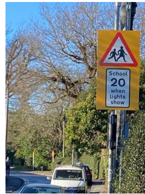
Traffic calming measures

CLESA also paid towards traffic calming measures on Chestnut Lane this term. Prior to lockdown, CLESA agreed to fund half the costs of the signs and lights installed on the road following a campaign led by parents to tackle speeding along the road, with the local Council providing the remainder of the funding.