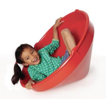
Playground equipment for Elangeni